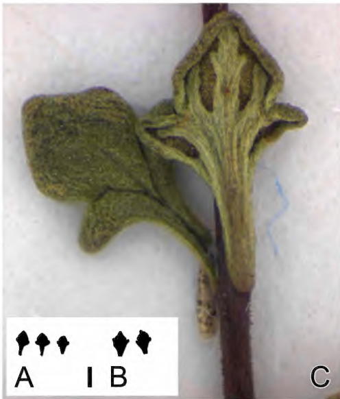
Fig. 2. Uppermost leaves, from dried herbarium specimens, of main inflorescence-bearing axes in Euphrasia amplidens . A–B Upper inflorescence leaves, silhouettes in actual size; C Upper pair of leaves, just below inflorescence, of showing adaxial (LHS) and abaxial (RHS) leaf surfaces. Scale bar: 0.5 mm. — A M. Wapstra & B. French s.n. (AD250975); B P. Milner 16 (AD250981); C K. Ziegler s.n. (HO566956, right hand sprig on sheet).

evident in E. striata R.Br., E. fragosa W.R.Barker and E. semipicta W.R.Barker, but from all of these it differs by its glandular indumentum, dense on the calyces, bracts and rachis and extending onto the leaves and branches.